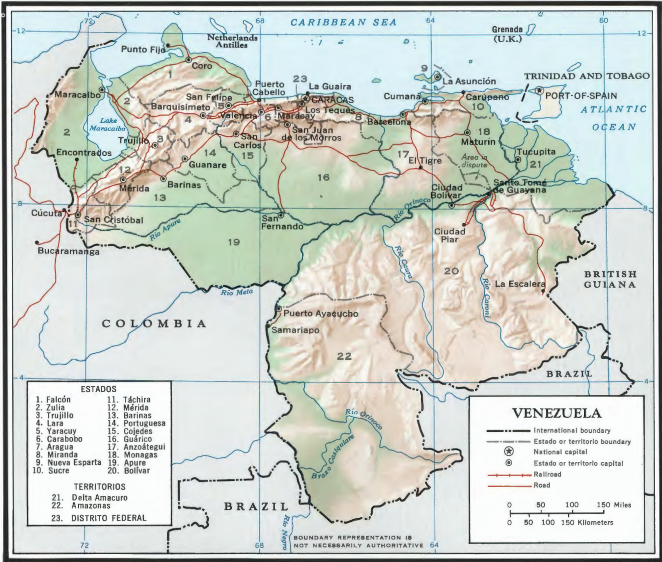
Base 52630 7-65