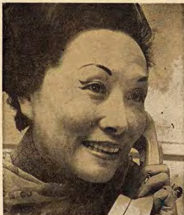
By Jim McNamara—The Washington Post

"I don't waste time on . . . small sums."