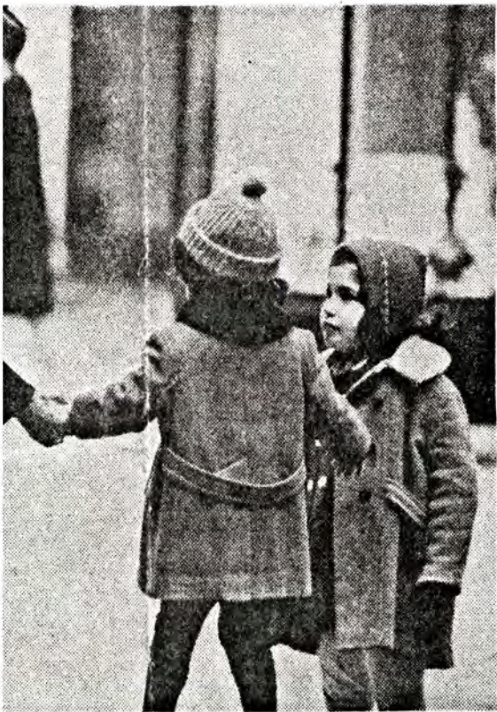
One over-eager little girl is escorted gently, but firmly, off an exhibit.

Wheee! Besides all those giant stuffed beasties of old at the Field Museum of Natural History, there are jungle gyms all around to climb—and sometimes to hurdle. But the kindly custodians (whose patience is often sorely tried) referee the contortions of gym class as the children gaze up at the giant pachyderms and bony dinosaurs, often trying to get closer because just looking isn't enough.