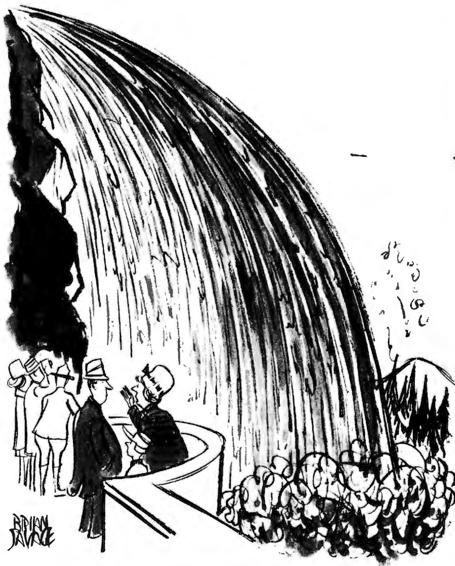
"Timmy has to tinkle."

GARRISON: The exact nature of the President's wounds, as well as the disposition of the bullets or bullet fragments, are among the many concealed items in this case. I told you earlier about the men on the grassy knoll whose sole function we believe was to catch the cartridges as they were ejected from the assassins' rifles. We also have reason to suspect that other members of the conspiracy may have been assigned the job of removing other evidence—such as traceable bullet fragments